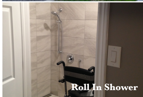
Roll In Shower